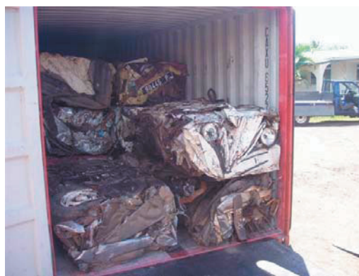
Tahitian bales cars bound for Auckland