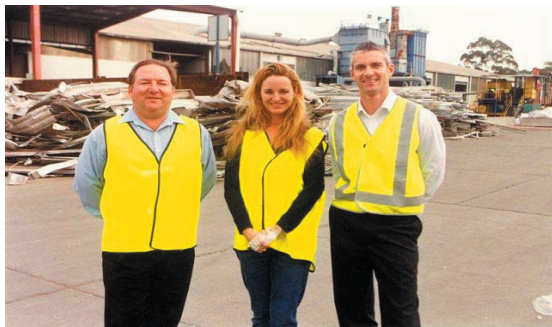
Filming at Sims Pacific Metal.

New Zealand. The films were distributed by the Secretariat for the Pacific Region Environment Program (SPREP).