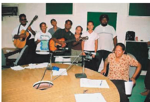
The Kilongasti Theatre Group perform a radio play.