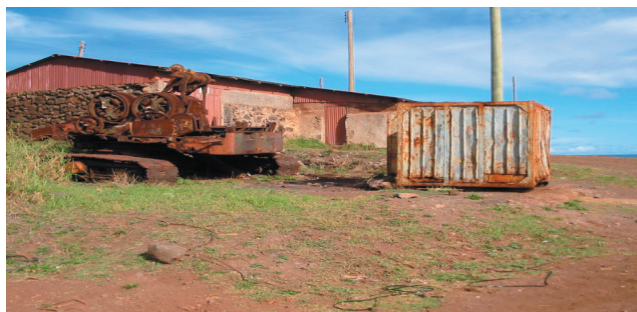
Scrap metal laying around Easter Island.