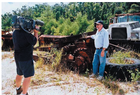
Filming in Niue