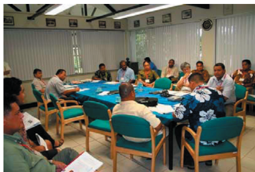
Delegates to the "Difficult Wastes" Seminar, Samoa