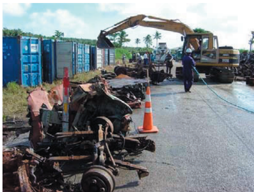
Heavy scrap metal oxycut and lined up for placement in containers, Niue.