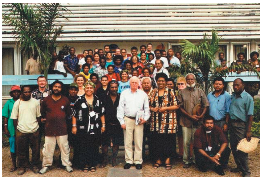
Group photo after the presentation of the peoples forum on the Pacific Plan to Greg Urwin, Secretary General of the Pacific Islands Forum Secretariat, pictured centre.