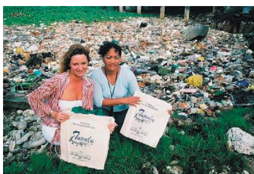
The replacement calico bags used in Tuvalu.