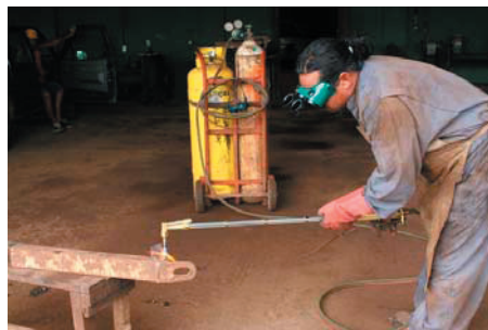
Waste Management Department with Equipment from Sims. Testing the new Harris Gun Torch from Sims.