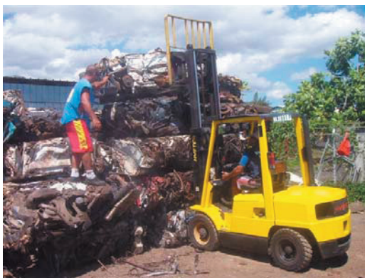
Scrapped cars in Tahiti