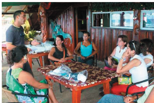
Easter Island trial Mums learn about the Eenees compostable nappy.

IHFA and Internationaler Hilfsfonds e.V co-produced an information film "Compostable Baby Nappies in the Pacific."